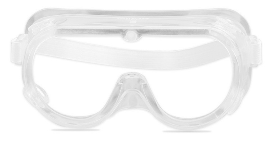
Part number C0804004

Our goggle personal protective equipment (PPE) is the product of choice by healthcare and industry professionals worldwide. It is designed for the protection of the user's face from hazards such splashes (e.g. chemical liquids), flying objects (e.g. small debris) as well as to control and minimize infections (i.e. protection from sneezing). The goggle is convenient to use, comfortable to wear, durable, made with safe materials and offers an exceptional product quality.