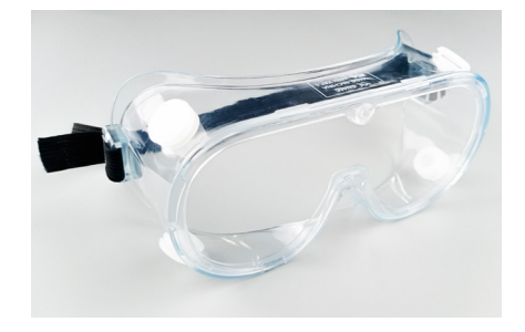
outlet valve adjustable band